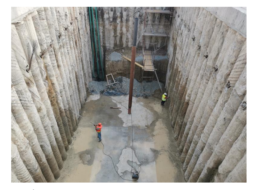
3<sup>rd</sup> PRIZE: Cleaning of Piles