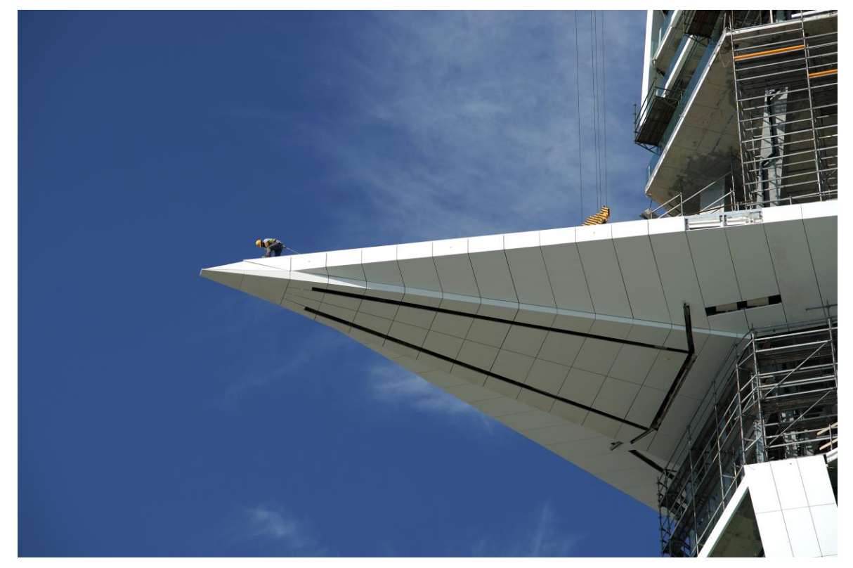
1<sup>st</sup> PRIZE: Working at the edge