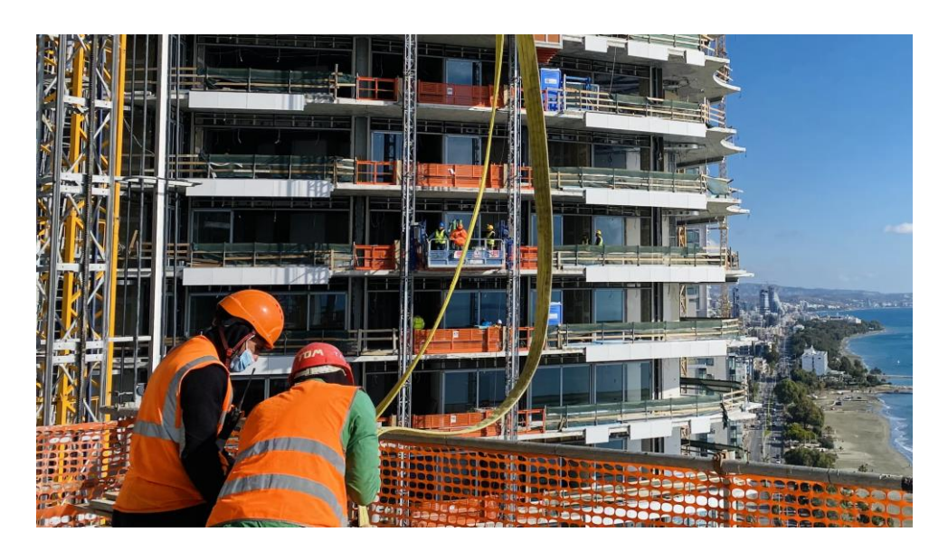
2nd PRIZE: Above & Beyond